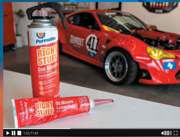
RED GASKET MAKERS